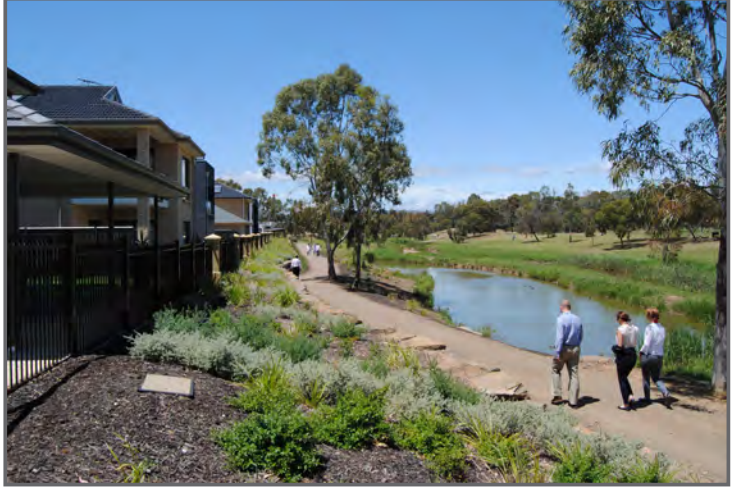
Fencing to reserves provides a consistent style