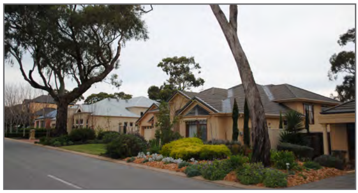
Verge areas should be maintained to a suitable standard

The use of terraced retaining walls can create separate levels of garden beds and usable outdoor spaces. Raised decks can also be constructed around the home to provide a flat entertaining area and capture views and breezes.