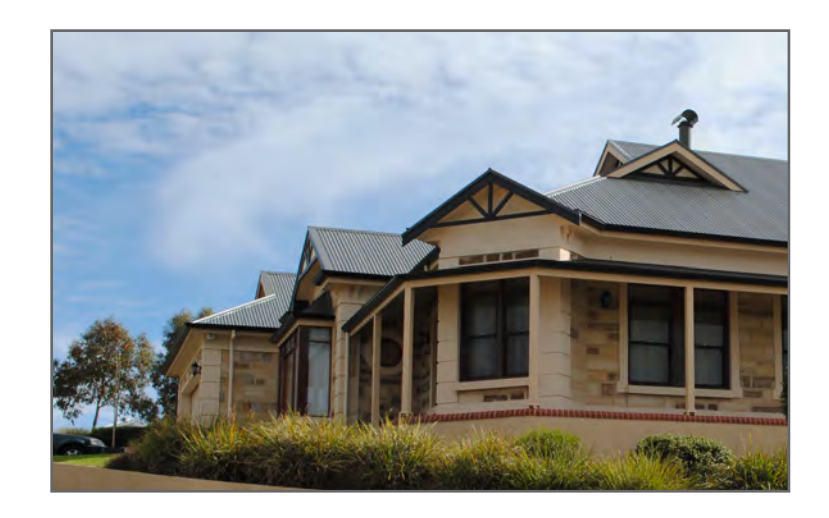
Verandahs and porches not only improve the appearance of your home, they can also protect your windows from harsh summer sun

Entry porches and porticos can generally be built abutting a street front property boundary and preferably integrated into the street front fencing design using similar materials and style.