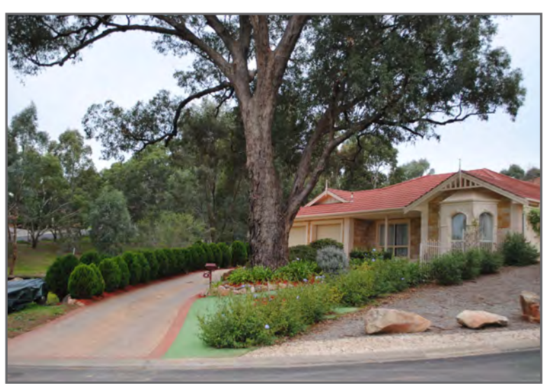
Driveway alignment should avoid existing trees