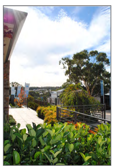
Use your blocks natural topography to create great outdoor spaces and capture views