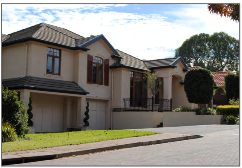
Locate garages to help minimise driveway grade