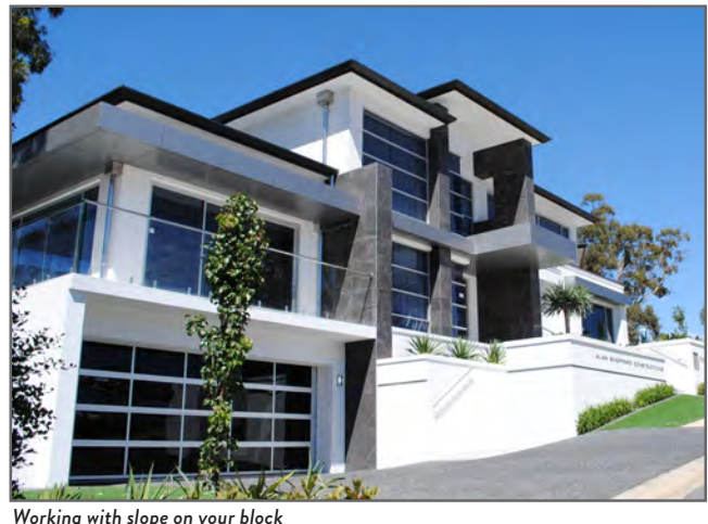
Working with slope on your block

Mount Barker Council has different requirements for minimum private outdoor open space depending on your block size. Blocks less than 300sqm require a minimum of 24sqm of private open space, blocks between 300sqm to 500sqm require a minimum of 60sqm and blocks over 500sqm require 80sqm. Your builder/ architect can assist you with this.