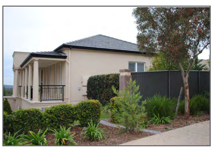
Colorbond fencing not to come forward of the main building line

Blocks backing onto any lakefront/ reserve should have side boundary fencing forward of the lakefront/reserve building line that integrates with the lakefront/ reserve fencing. Solid fencing will generally not be permitted.