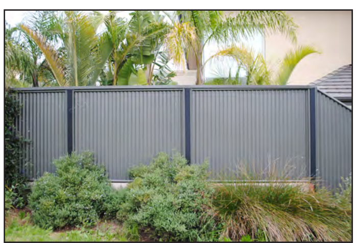
Preferred fencing profile