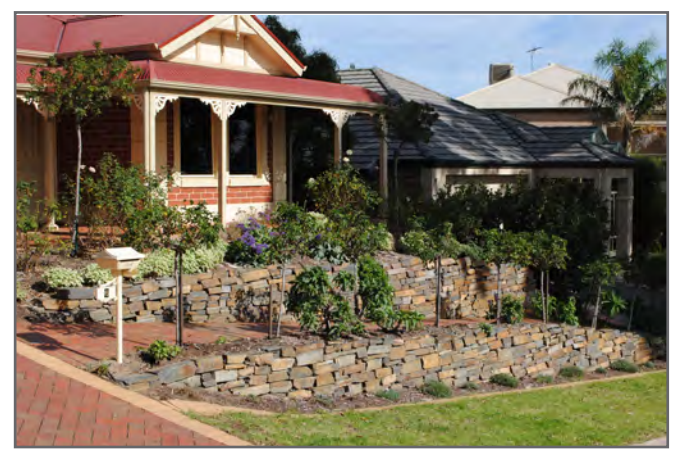
Use of lower terraced retaining walls is better than larger expensive walls

Retaining walls should be constructed of materials that complement the natural environment such as stone or feature rock, feature exposed or rendered brick, interlocking feature panels such as treated concrete sleepers or feature timber. Plain concrete with an untreated finish is not acceptable for walls directly visible from the street or public areas. Alternative feature materials that complement the style of your home may be acceptable subject to approval.