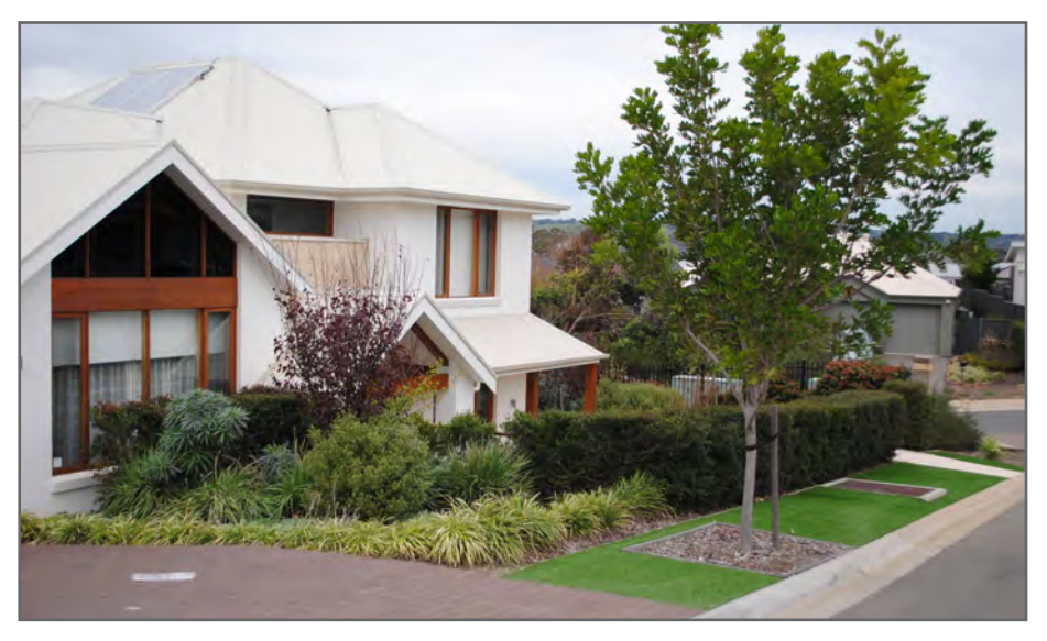
A variety of roof styles is encouraged

A minimum internal floor to ceiling height of 2.7m applies to the ground floor of all dwellings. Higher ceiling heights are encouraged. This allows for the provision of ceiling fans in the home while also enhancing internal living areas.