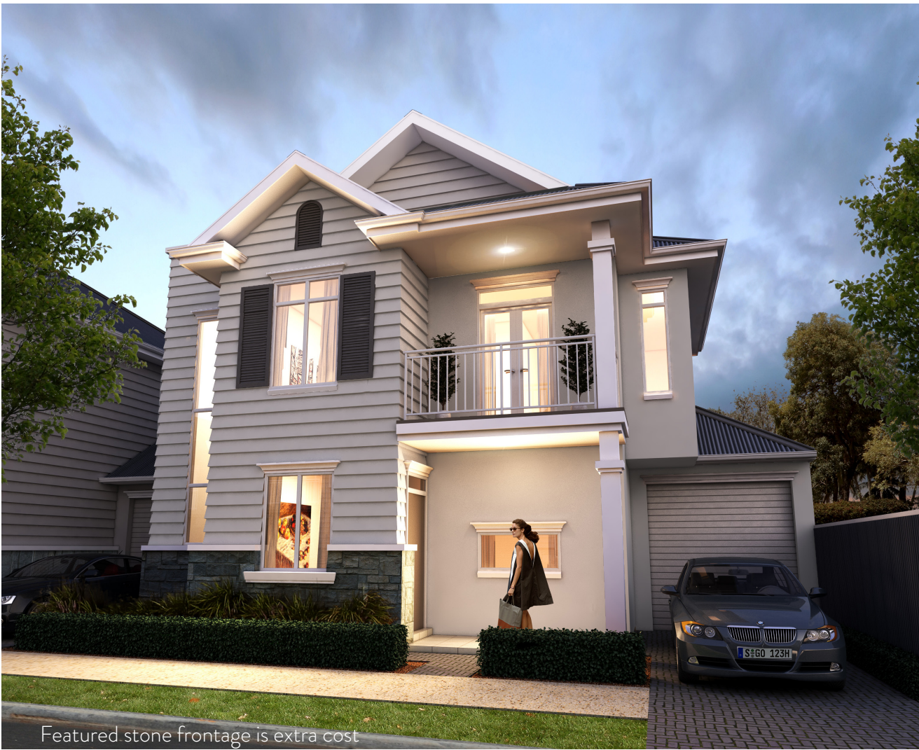
Featured stone frontage is extra cost