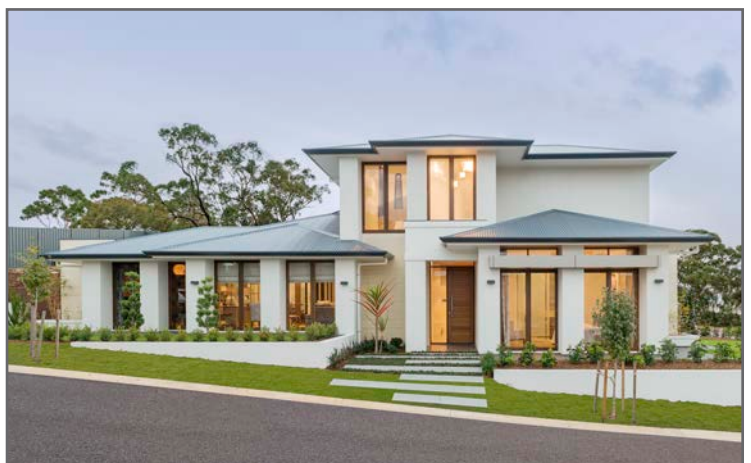
Use of different colours and quality materials can give your home a unique style and character