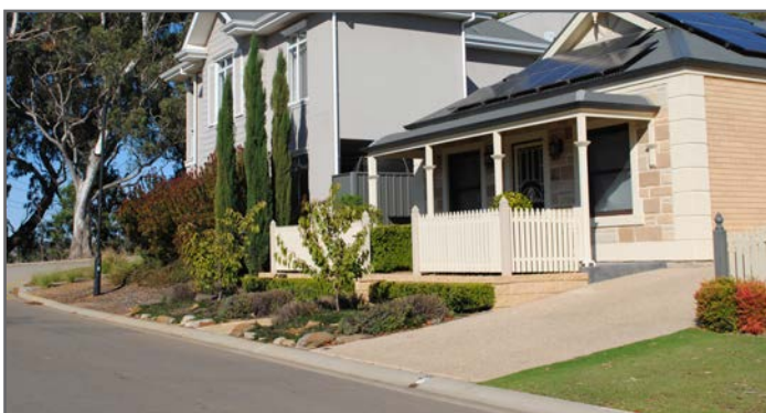
Verge areas should be maintained to a suitable standard

The use of terraced retaining walls can create separate levels of garden beds and usable outdoor spaces. Raised decks can also be constructed around the home to provide a flat entertaining area and capture views and breezes.