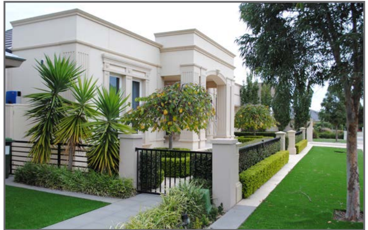
Feature street front fencing