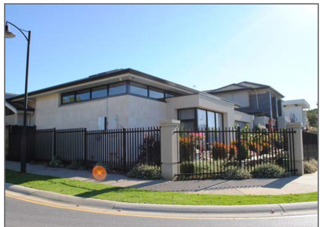
Homes on corner blocks need to address both street frontages