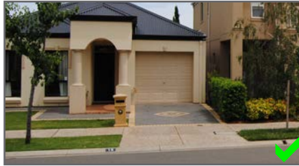
Driveway crossovers should not interrupt the footpath

Existing trees have been retained in the street to help enhance the unique hills character of Springbrook. Make sure your driveway alignment takes these into account and other fixed structures such as street lights, stormwater pits etc.