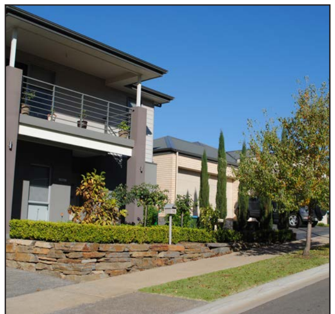
Where a footpath exists, an irrigation conduit is provided for you to link your home watering system to your front verge