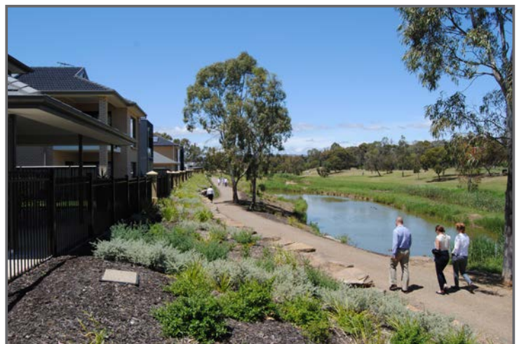
Fencing to reserves provides a consistent style