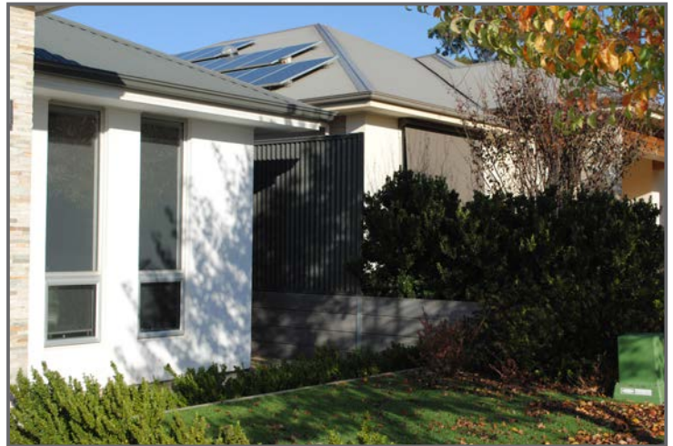
Colorbond fencing not to come forward of the main building line

Blocks backing onto any lakefront/ reserve should have side boundary fencing forward of the lakefront/reserve building line that integrates with the lakefront/ reserve fencing. Solid fencing will generally not be permitted.