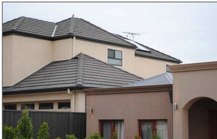
Ancillary structures should be located to reduce the visual impact from the street

The District Council of Mount Barker have developed an advisory document “Designing and Constructing Your Home” which provides further useful tips and ideas.