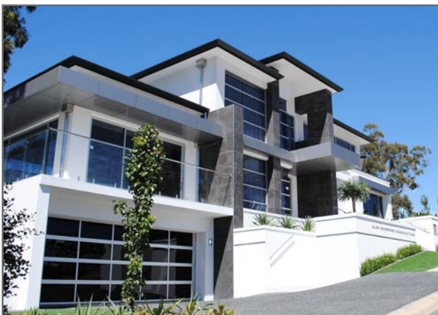
Working with slope on your block

Mount Barker Council has different requirements for minimum private outdoor open space depending on your block size. Blocks less than 300sqm require a minimum of 24sqm of private open space, blocks between 300sqm to 500sqm require a minimum of 60sqm and blocks over 500sqm require 80sqm. Your builder/ architect can assist you with this.