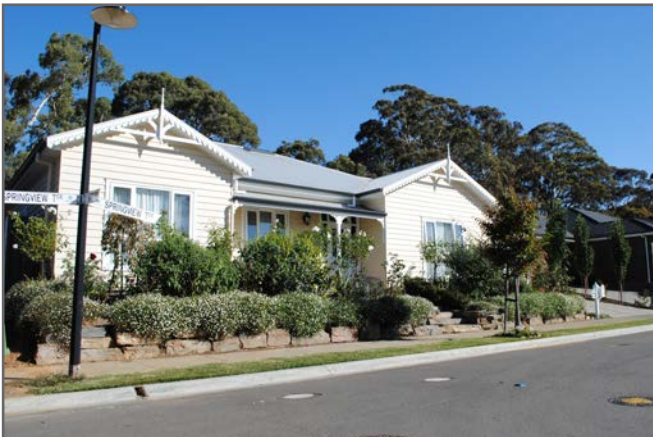
Use of lower terraced retaining walls is better than larger expensive walls

Retaining walls should be constructed of materials that complement the natural environment such as stone or feature rock, feature exposed or rendered brick, interlocking feature panels such as treated concrete sleepers or feature timber. Plain concrete with an untreated finish is not acceptable for walls directly visible from the street or public areas. Alternative feature materials that complement the style of your home may be acceptable subject to approval.