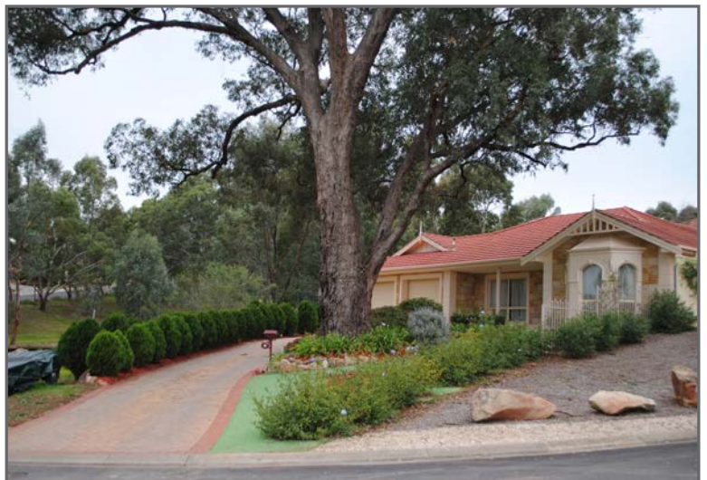
Driveway alignment should avoid existing trees