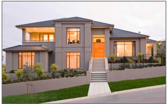
Work with the natural topography and incorporate feature landscaping