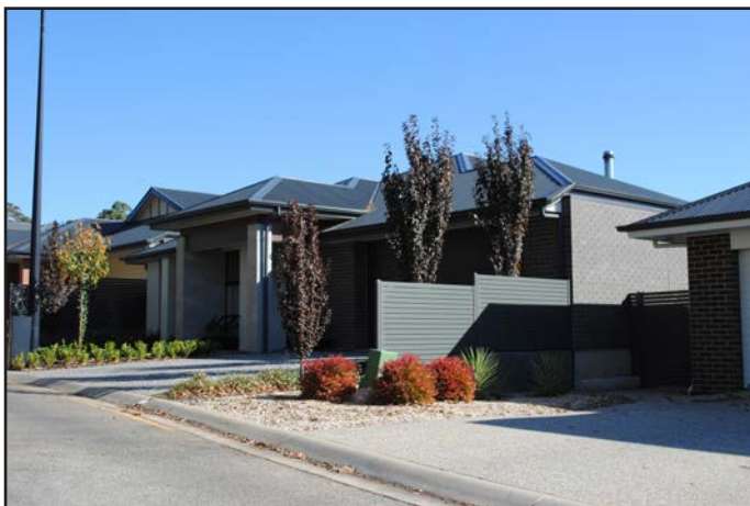
Feature fencing forward of building line

We strongly encourage you to make contact with owners of all neighbouring allotments where your property shares a common boundary during the early stages of considering your fencing / retaining requirements. Please contact Springbrook in the instance where your property shares a common boundary of an unsold allotment or future development land.