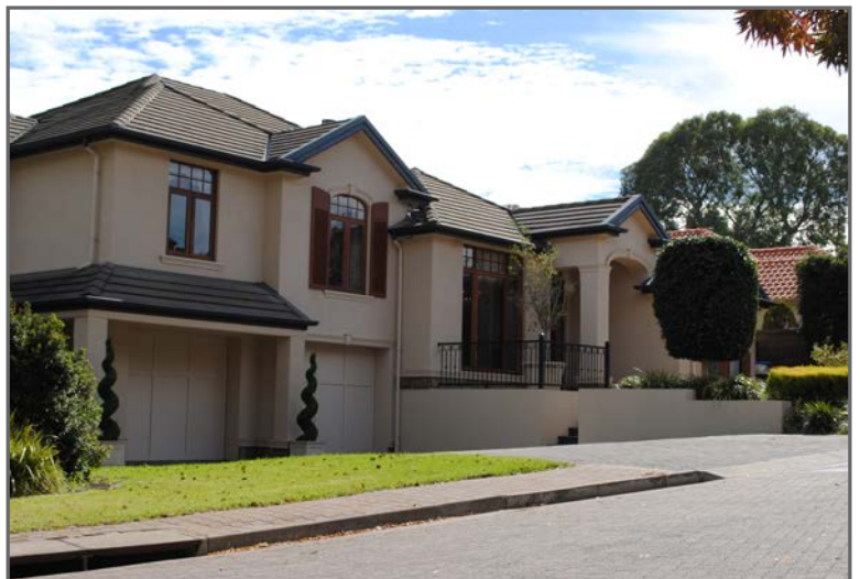
Locate garages to help minimise driveway grade