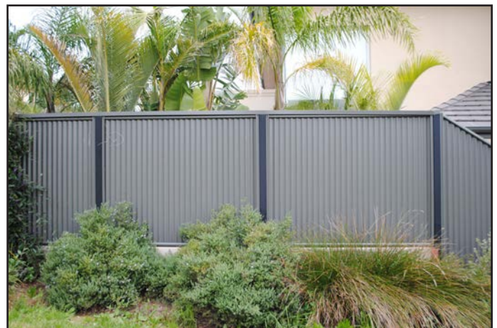
Preferred fencing profile