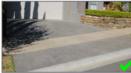
Driveway crossovers should not interrupt the footpath

Existing trees have been retained in the street to help enhance the unique hills character of Springvale. Make sure your driveway alignment takes these into account and other fixed structures such as street lights, stormwater pits etc.