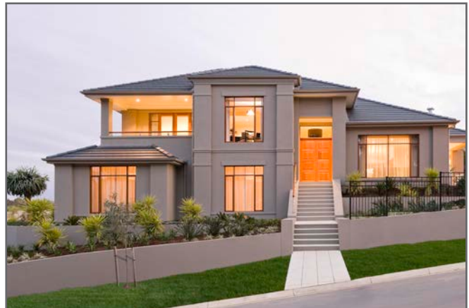
Work with the natural topography and incorporate feature landscaping