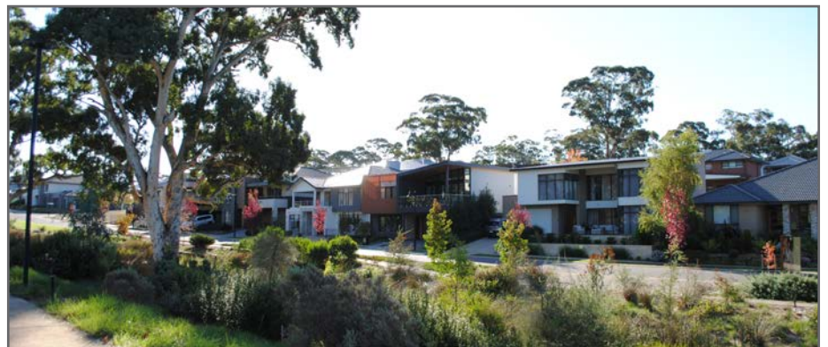
Use your blocks natural topography to create great outdoor spaces and capture views