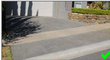
Driveway crossovers should not interrupt the footpath

Existing trees have been retained in the street to help enhance the unique hills character of Springvale. Make sure your driveway alignment takes these into account and other fixed structures such as street lights, stormwater pits etc.