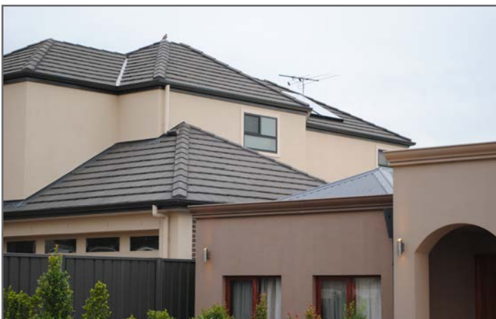
Ancillary structures should be located to reduce the visual impact from the street

The District Council of Mount Barker have developed an advisory document “Designing and Constructing Your Home” which provides further useful tips and ideas.